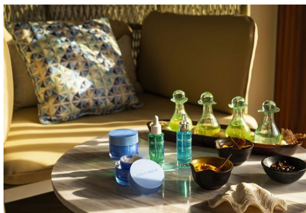
1. OCEAN POOL VILLA 2. SAFFRON AFFAIR 3. PULLMAN SPA PHYTOMER PRODUCTS